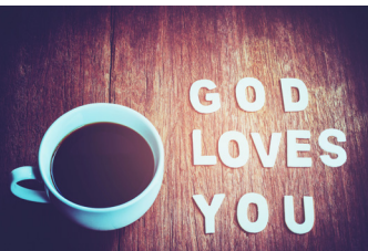
God loves you

“...the love of God is poured out in our hearts through the Holy Spirit...”