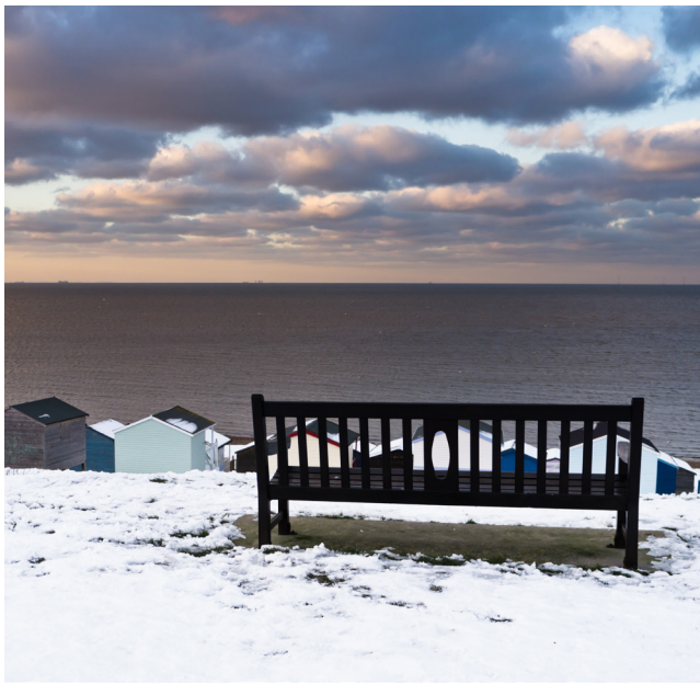
Snow in Whitstable, Kent

“...the thorn is a very famous tree in Christianity...”