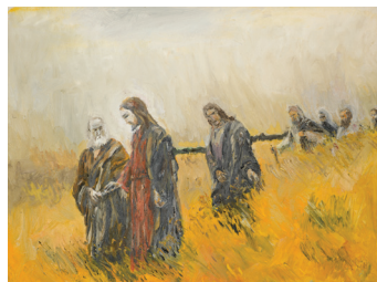
Jesus and his disciples

“...[Jude] is not just a passive bystander, listening to Jesus...”