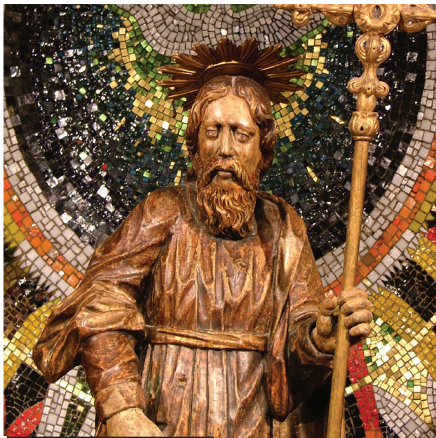
Shrine of Saint Jude

“...[Jude] is not just a passive bystander, listening to Jesus...”